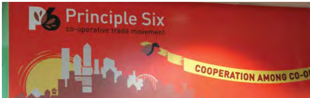
Seward Co-op has added P6 graphics above the community bulletin board (top) and deli counter (bottom).