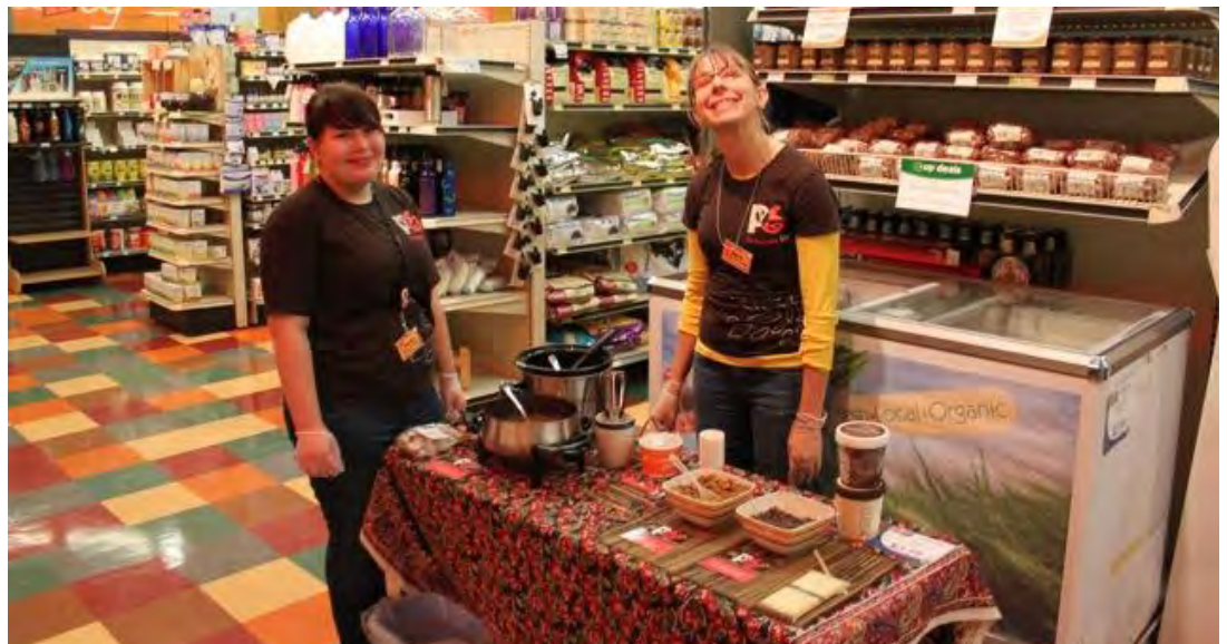
Community Mercantile staffers in their P6 shirts.