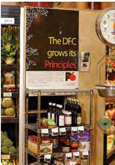
A Davis Food Co-op P6 sign.