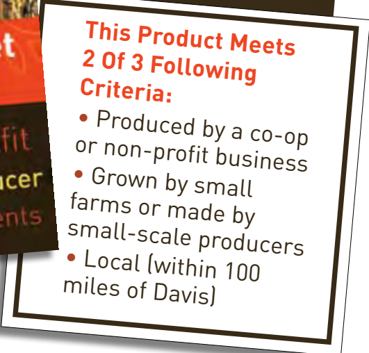
P6 shelftalkers from Brattleboro Food Co-op (top), Davis Food Co-op (right), and The Merc (above).

products and those made by cooperative businesses as well.”