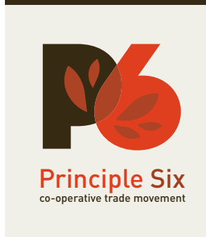
Davis Food Co-op's P6 brochure.